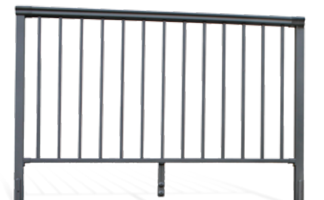
Over The Post (OTP) Side/Fascia Mount